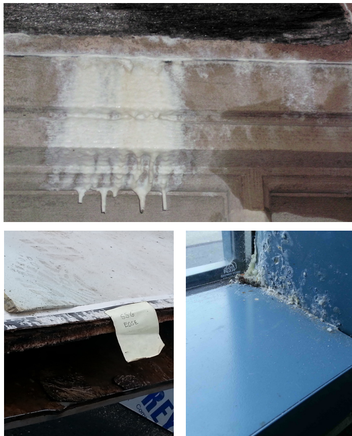
Figure E: Corrosion: Top: Masonry salts leaching from the mortar can drip onto the aluminum window frame of the glazing system; Left: CAPTION; Right: CAPTION

Pitting is the most common type of corrosion. It occurs only in the presence of an electrolyte (either water or moisture) containing dissolved salts, usually chlorides (Figure E). Additionally, aluminum is often in proximity or contact with steel components that have been coated with zinc to prohibit rusting, such as steel bolts. Over time as the zinc coating wears away, or in the presence of moisture, the steel can aggressively attack the aluminum. The surface oxide film that develops naturally is also not effective in protecting the aluminum in a highly corrosive environment, such as a coastal zone.