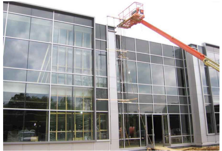
Figure C: Above and right: Specular painted finishes are applied to create depth and relief within the glazing assembly.

Various resin bases in paint include acrylic, epoxy, polyester, and urethane. Resin gives the finish its mechanical characteristics. Some resins are more flexible than others and will tolerate some conditions better than others. Resin also gives the film its gloss and gloss-retention characteristics as well as its resistance to abrasion,