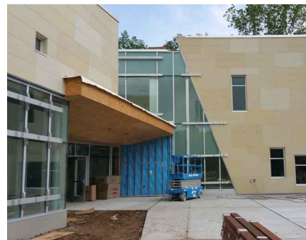
Figure I: Left and below: The glazing system can be engineered to accommodate different geometries as well as support the cladding material.