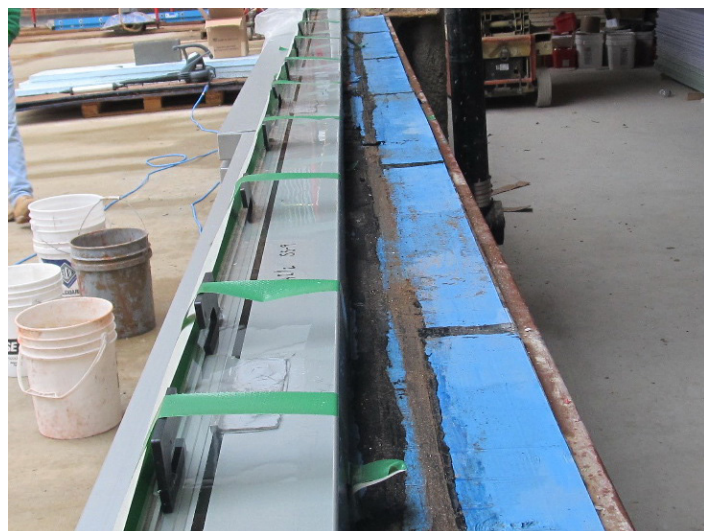
Below: Sill dam testing in progress.