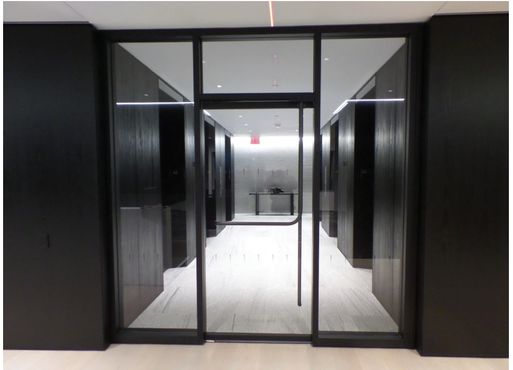
Elephant door to elevator lobby; all images courtesy Beletz Bros.