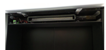
Top to bottom: elephant door sliding into wall recess; elephant door halfway out showing central egress door; leather-wrapped handrail; elevator bank; elevator magic mirror finish detail and mechanism detail