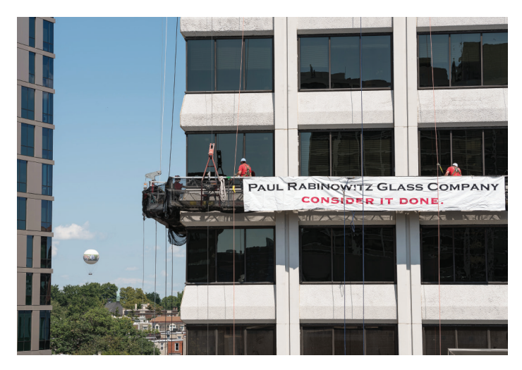
Left: old single-pane glazing and new insulated glazing side-by-side, showing the improved light transmission; right: Rabinowitz glaziers installing the new glass on the freshly painted façade.