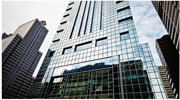
mage © Rabinowitz Glass